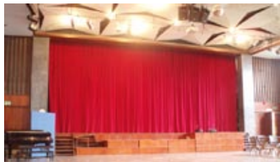
Stage curtains in the Queen's Hall. One of our projects this year is to replace the main curtains in the Hall