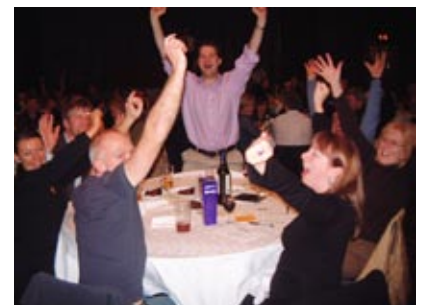
This table may have won the Quiz Night!