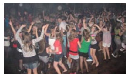
Boy-girl interfacing - otherwise known as the DISCO