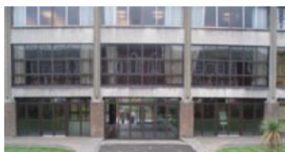
The ground floor glazing was provided by donations from the PA

If so, by contributing to the RGSPA, either by your time and involvement or just as a simple one off subscription then you will enhance your son's Royal Grammar School experience.