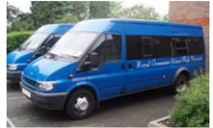
The School minibuses. One of our projects this year is to replace the eldest of these

But joking apart, please read overleaf and see how you can contribute to make his time something to really cherish and remember!