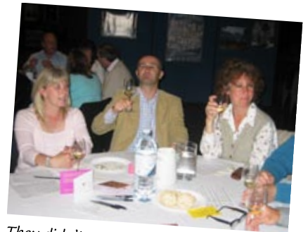
They didn't seem to get it that you have to spit the wine out and not swallow it!