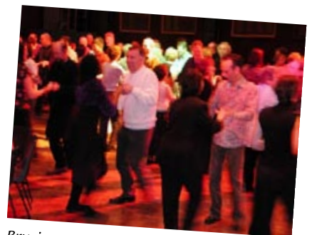
Brucie was most impressed by the standard of dancing, NOT! But it was Fun!