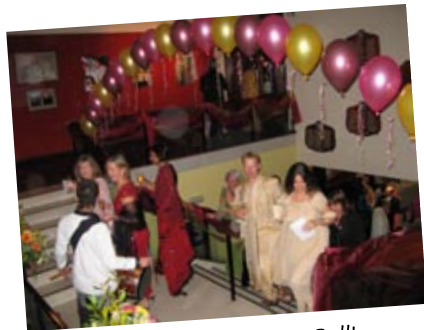
"Bollywood Dreams" Autumn Ball!